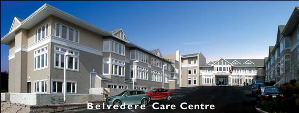
Belvedere Care Centre