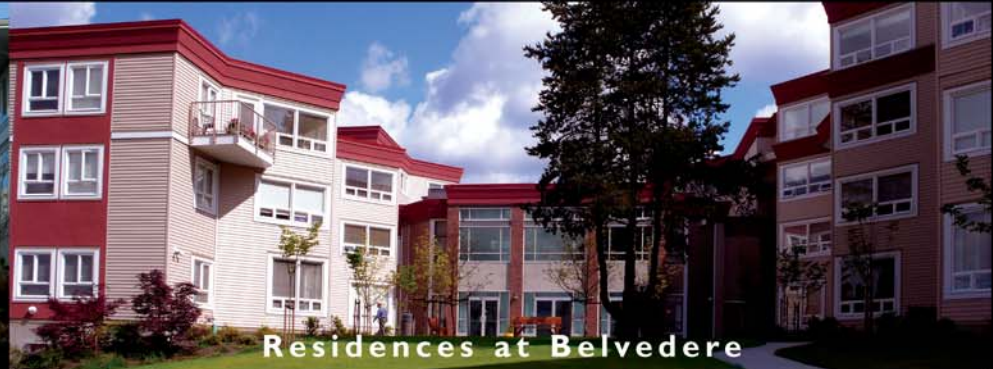
Residences at Belvedere